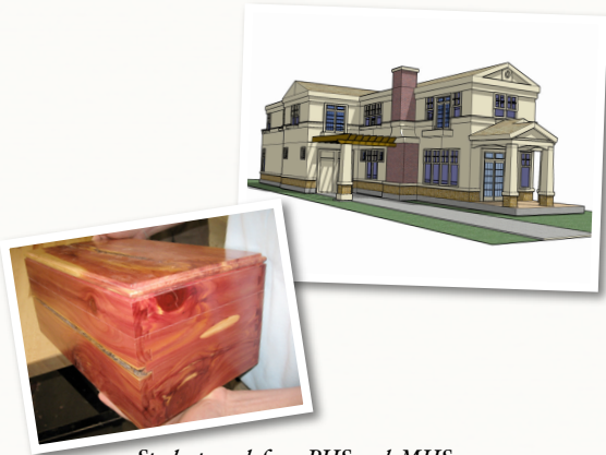
Student work from PHS and MHS

Want to design buildings or landscapes? Like to build things? Work with tools? Then taking courses in this cluster is RIGHT for YOU! Discuss your career goals with your counselor. The two of you can create a four-year plan preparing YOU for your career choice! Teachers are also available to answer questions about the classes they teach. We welcome you to this cluster!