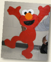
Yard art created by a student at PHS

Example of a coherent sequence focused in architecture and construction: